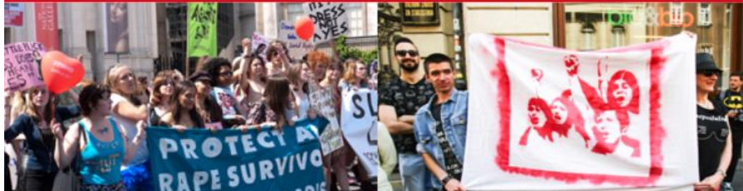
Council of Europe leaflet on the Istanbul Convention

At the initiative of the liberal president of PACE Rik Daems, during the June part-session the Parliamentary Assembly celebrated the 10 th anniversary of the Council of Europe Convention on preventing and combating violence against women and domestic violence (Istanbul Convention). The high-level panel participating in the debate included laureate of the 2018 Nobel Peace Prize Nadia Murad, Prime Minister of Belgium Alexander De Croo, President of the Romanian Senate Anca Dana Dragu, French Minister for Gender Equality Elisabeth Moreno and UN Special Rapporteur on Violence against Women Dubravka Šimonovic.