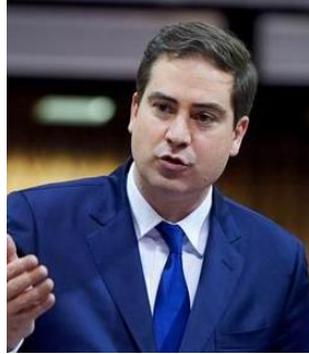
Olivier BECHT (France) Chair of the Committee on Culture, Science, Education and Media